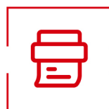
Print on-line and real-time test reports (UT675A)