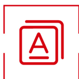
Language option (Chinese/English)