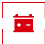
12V cranking lead acid battery test

UT673A/UT675A battery testers can be used to analyze the battery health of automobile batteries, suitable for battery capacities from 3 to 250Ah. These CE certified testers can rapidly and accurately detect common faults caused by battery. UT675A also includes USB communication and built-in printer for report generation.