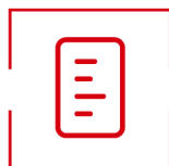
Display battery capacity, voltage, resistance and life