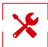
Test without battery disassembly