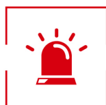
LED color indication for test result (UT673A)