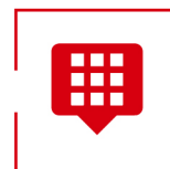
10 types of battery standards