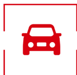
12V/24V charging or cranking system test