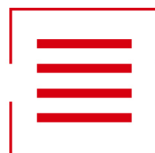
Four-terminal Kelvin test